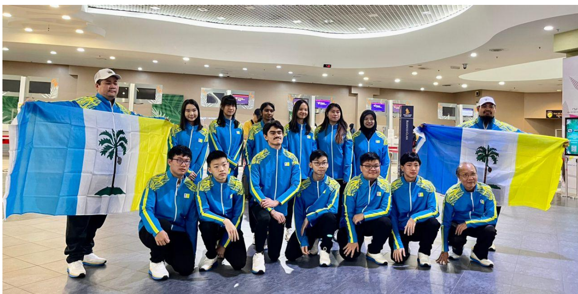
The Penang Sukma Contingent