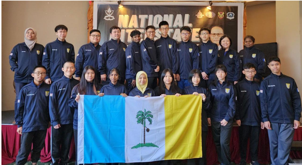
Well Done, Penang!