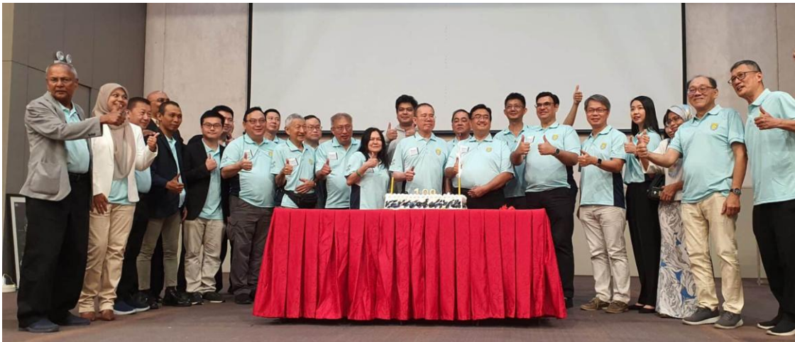
Happy Centenary FIDE!