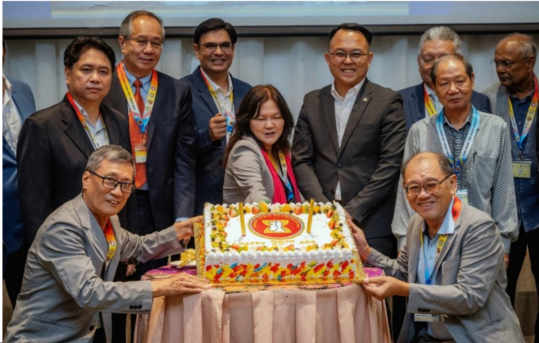
Happy 25 th Anniversary Asean Chess Confederation!