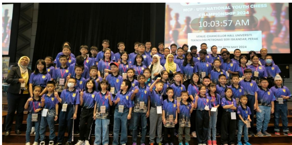
The Penang Contingent: Starting them young!