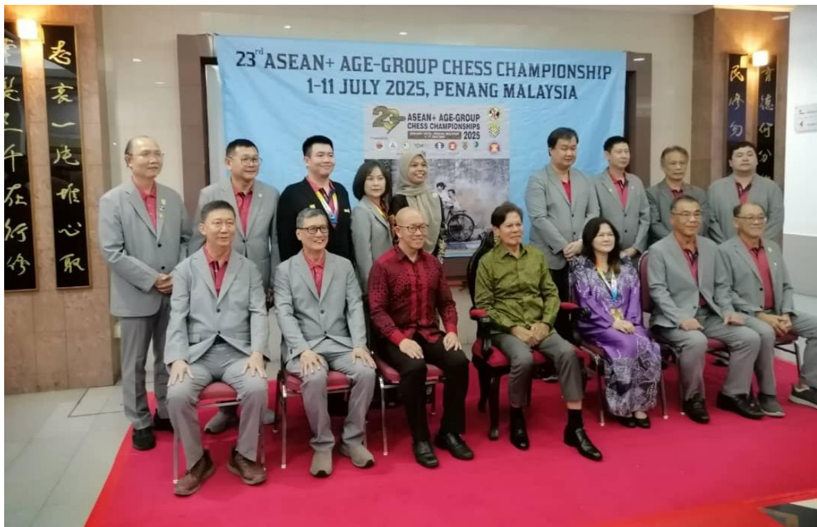
A Group Photo with TYT Tun Dato' Seri Utama Haji Ramli bin Ngah Talib