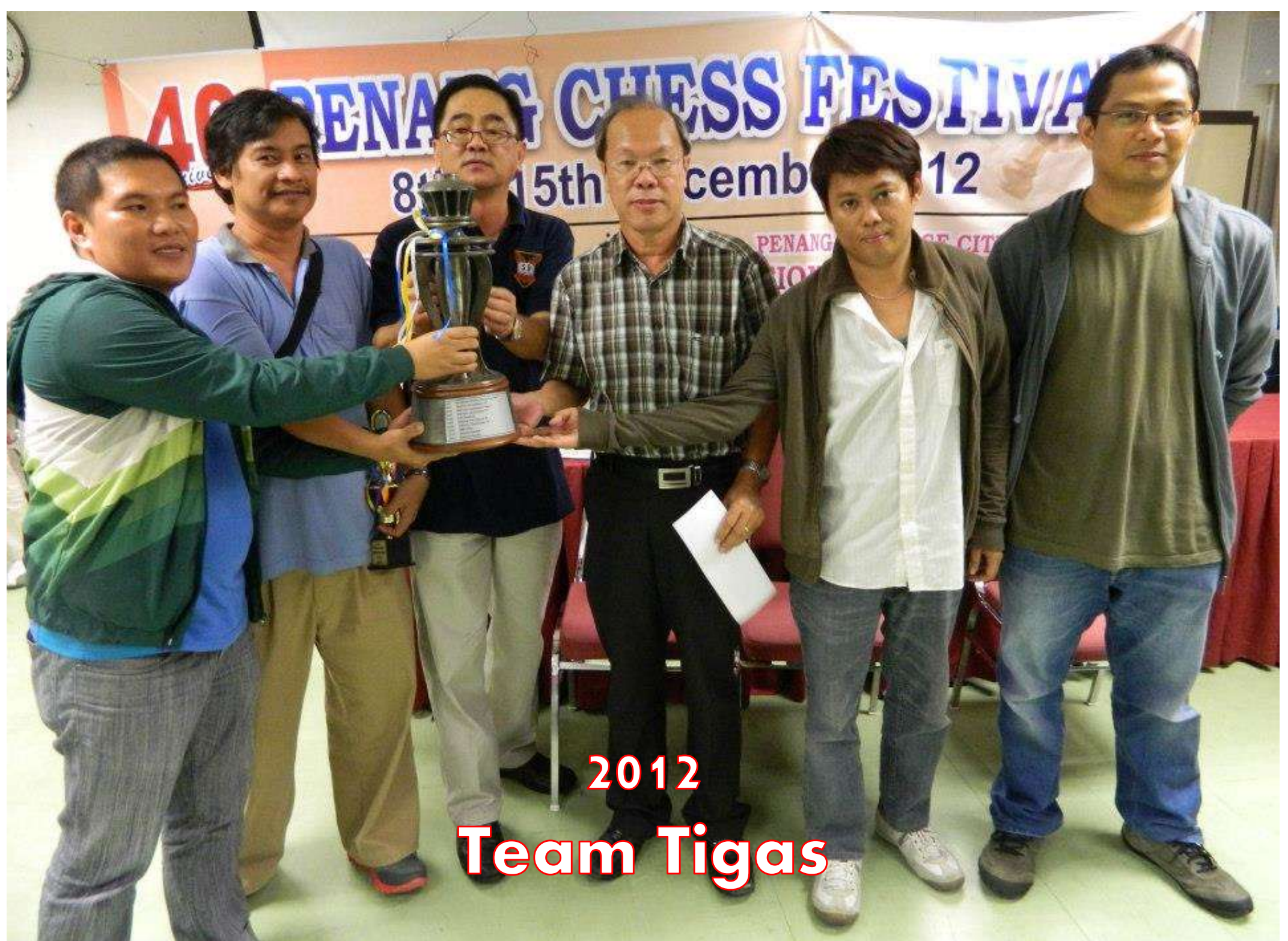
2012 Team Tigas