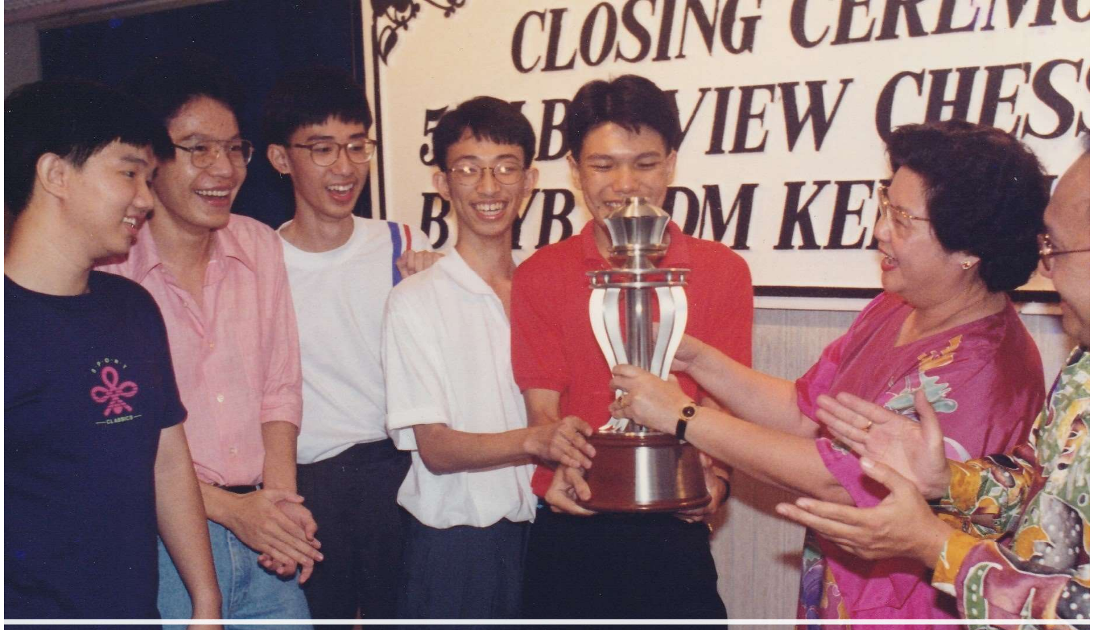
1995 Chung Ling High School