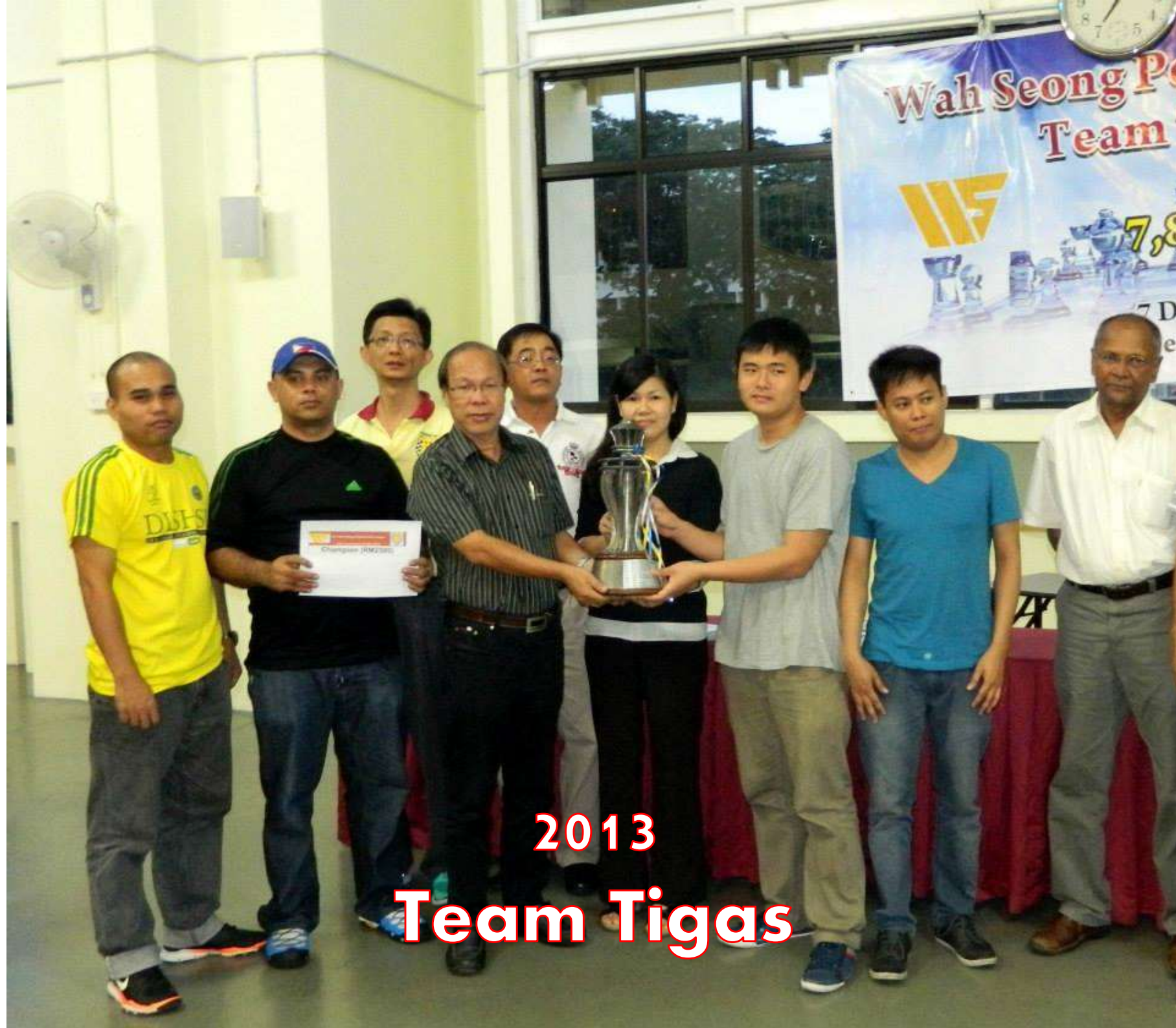
2013 Team Tigas