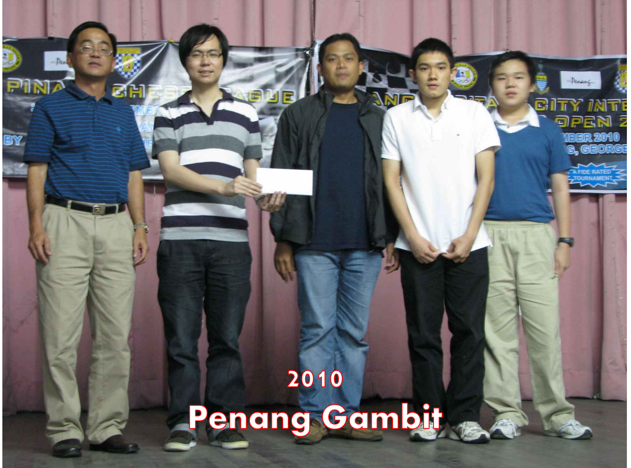
2010 Penang Gambit